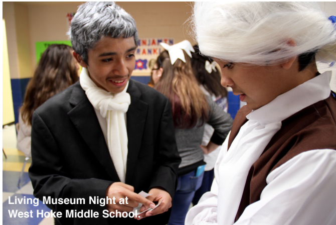
Living Museum Night at West Hoke Middle School