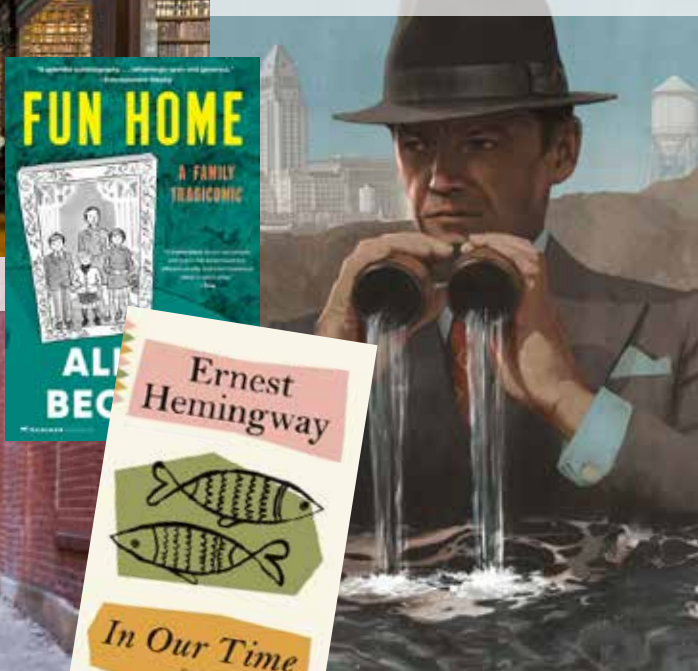
Unpacking Justice: The LA Aqueduct and Chinatown • February 12