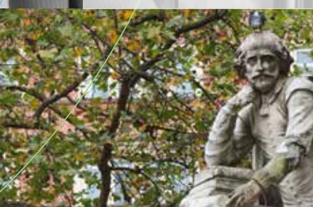
Shakespeare's Family Ties • April 12