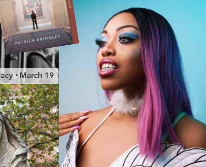
Suzi Analogue • April 30