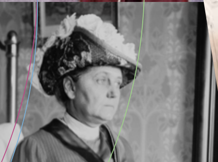
Jane Addams on Democracy • March 19