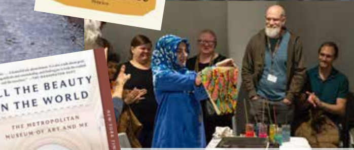
Art of the Islamic World • May 22